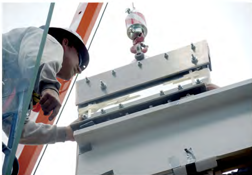
This page Construction photos show the installation of the glass curtain walls in the library's two glazed cubes. All of the steel beams and outriggers are purposefully exposed and cambered toward their apex in the most exposed corner of the cube at the center of the park. (Only the outriggers are visible, against the glass roof return, in the Broadway cube.)

The new structure is transparent and welcoming, with state-of-the-art technology and ample spaces to read, learn, and relax. It holds more than 75,000 books and multimedia for children and adults in English, and 36,000 books and multimedia in nine different languages. The design team took great care to reference historical elements of the Carnegie building, adding a “memory wall” at the entrance to the library made of bricks from the original facade and a fireplace mantel from the previous library’s children’s room.